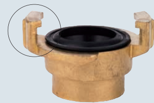
Not deformed 'GK'-claws